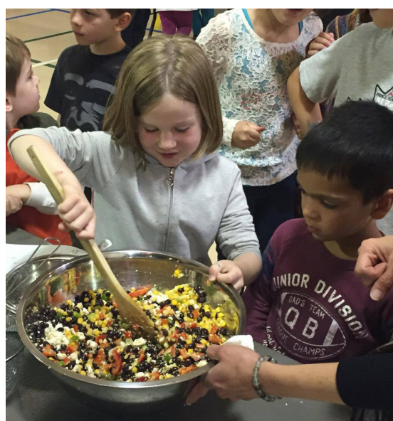
Final step: stirring the couscous salad.