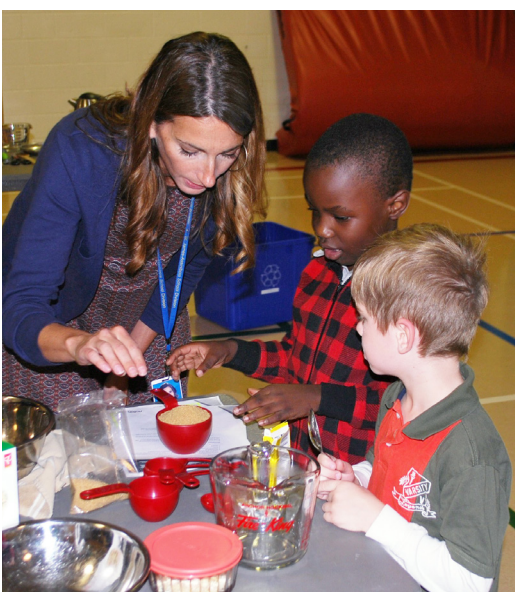
Learning how to make couscous one step at a time.