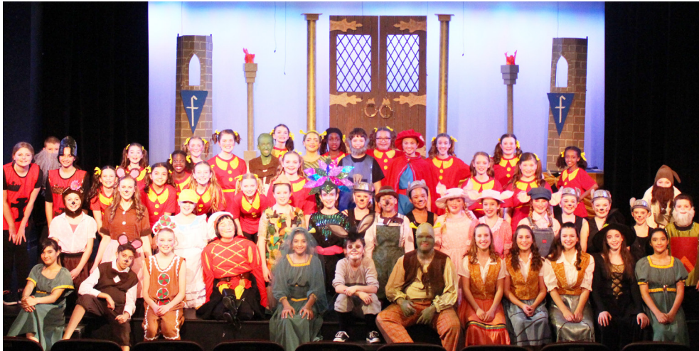
Lincoln Middle School's musical production of Shrek Jr. received a School Award on behalf of Rainbow Stage.

At the Middle Years level, Lincoln Middle School earned one of two $750 Rainbow Stage Performance Awards presented in Manitoba. The school brought Shrek Jr. to life and received its second consecutive School Award from Rainbow Stage. Congratulations to both schools on the fantastic shows!