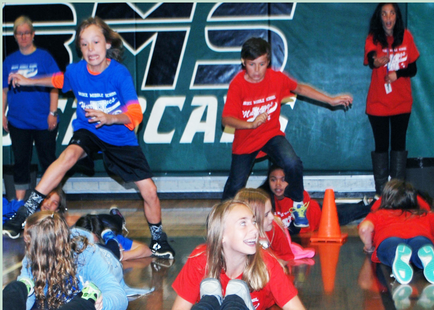
Two of the four B.L.A.S.T. teams caught in the middle of the caterpillar activity inside the gym at Bruce Middle School.