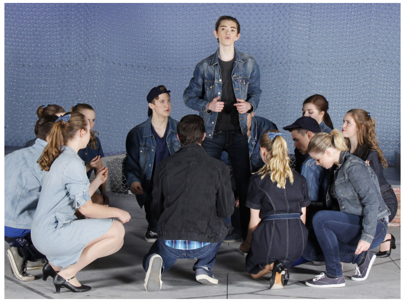
The favourite classic West Side Story performed last year at Westwood Collegiate earned the school its fifth consecutive Rainbow Stage Award.

Over the past decade, many exceptional ideas and leading initiatives have been introduced in our schools in response to the content shared at the youth forum. Each year, students and staff members create a pledge saying how they plan to make a change this year and post their statement onto a commitment poster. This year's commitment poster, which hung on the wall at the event outlining the number 10, is an exciting sign that we can expect more innovative movements and acts of kindness within our schools in the coming year.