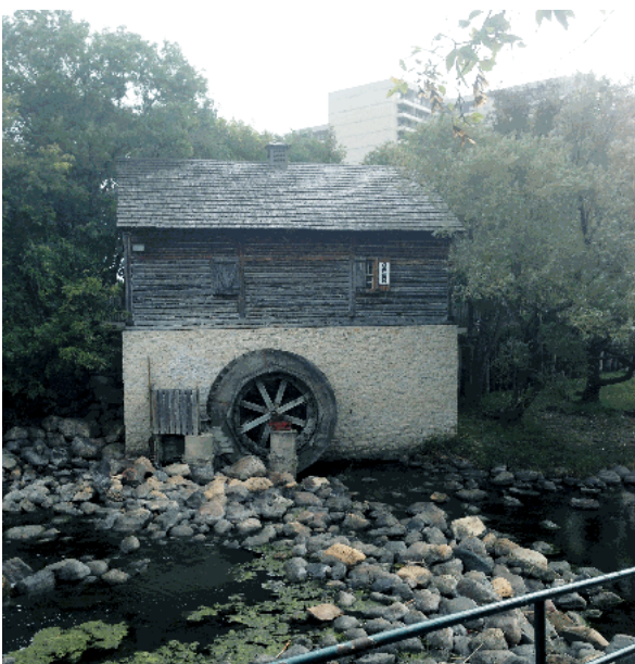
Cuthbert Grant's mill is located on the bottom left hand side of our logo. Grant constructed a