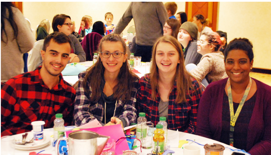
The John Taylor Collegiate table at the Divisional Youth Forum.