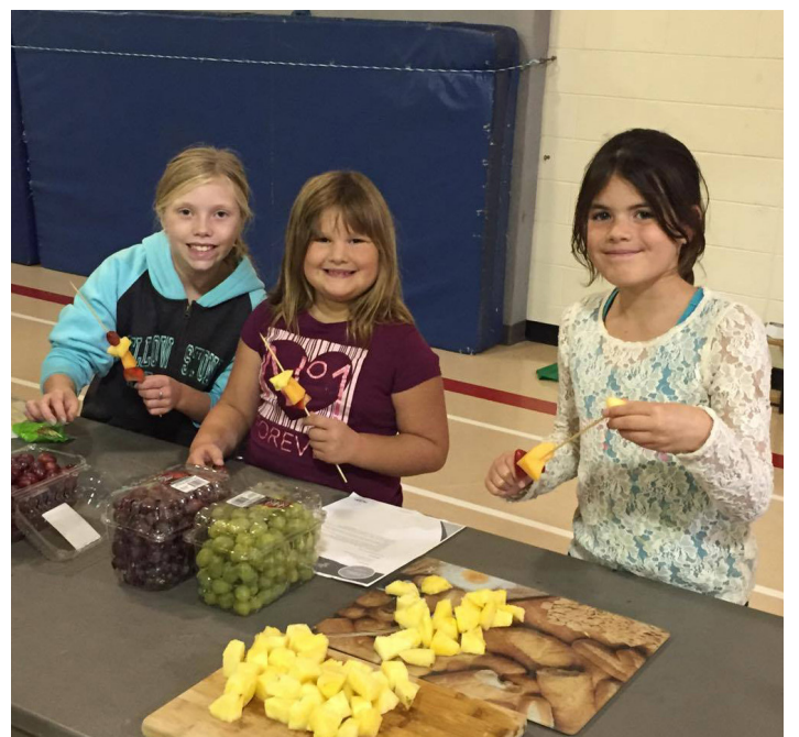
Students busy creating rainbow fruit kebabs.