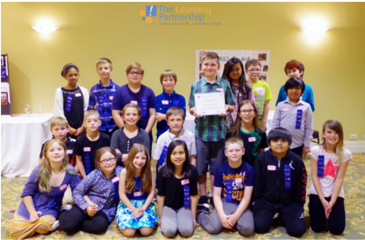
A Grade 4/5 Class from Linwood celebrates a successful business venture at the Fairmont Hotel Showcase, hosted by The Learning Partnership.